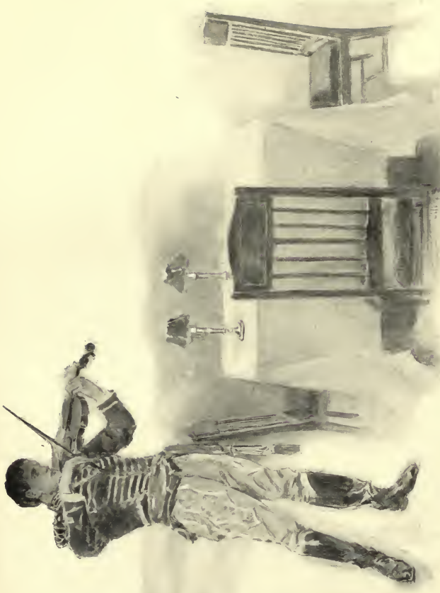
He played to the empty chair.